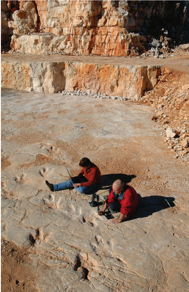
Figure 3 (left) – Theropod footprints at Vale de Meios track sites (Bathonian, Santarém, Portugal).