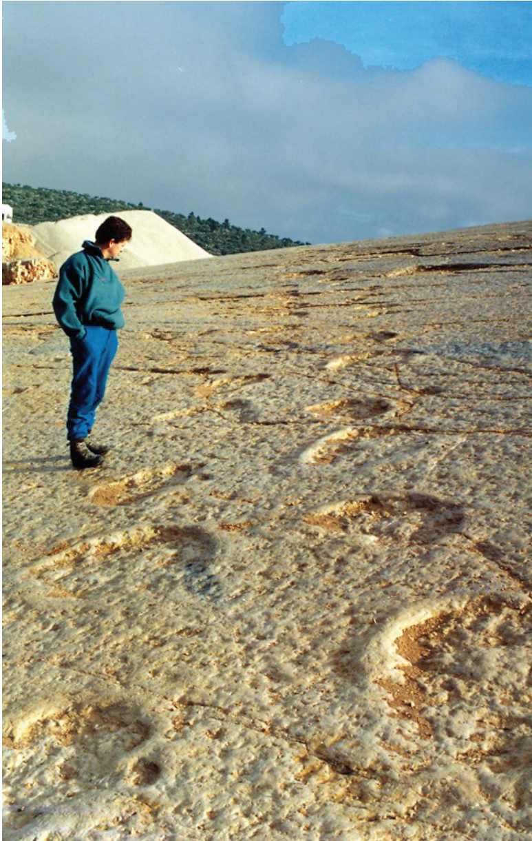
Figure 2 - Wide-gauge sauropod trackway at Galinha track site (Bajocian-Bathonian, Ourém - Torres Novas, Portugal).

(Olhos de Água track site, Mateus & Antunes, 2003) and in the Algarve: Salema and Santa track sites (Vila do Bispo). The Upper Cretaceous dinosaur track record is represented by the Carenque track site.