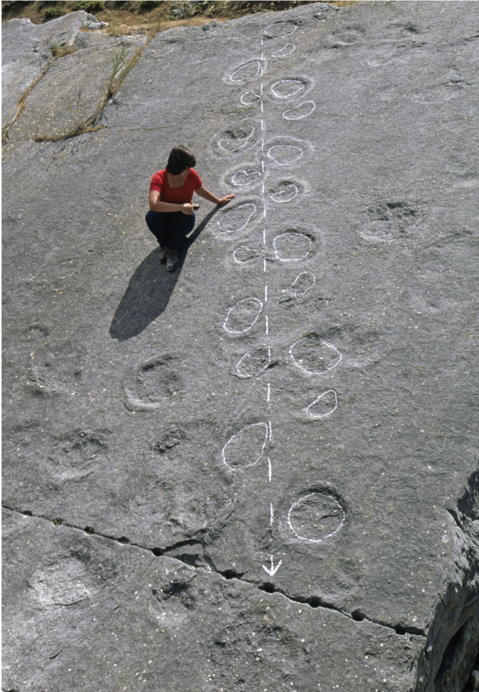
Figure 5 – Narrow-gauge sauropod trackway at Avelino track site (Upper Kimmeridgian, Sesimbra, Portugal).

beach (Santos et al. , 2000c). The main level revealed at least four bipedal trackways and isolated footprints. The well preserved prints in Santa track site reveal the characteristic iguanodontid morphology and their similarity with the prints attributed to Iguanodontipus isp. allows their assignment to this ichnogenus (Santos, 2003; Santos et al. , 2000c). Until now, it was recognized the presence of iguanodontid and small unidentified theropods in the Lower Cretaceous of the Mesozoic Algarve basin (Santos et al. , 2000b,c).