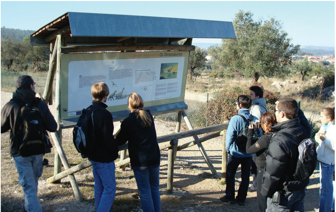
Figure 6 – Autonomous pedestrian trails are supported by outdoor informative panels throughout the entire Galinha track site perimeter.

were formed; karst; sedimentary rocks (limestones) and their origin; environmental impact of human activities; possible ways of dealing with the negative impact of quarrying activities in the landscape.